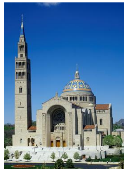
Shrine of the Immaculate Conception.